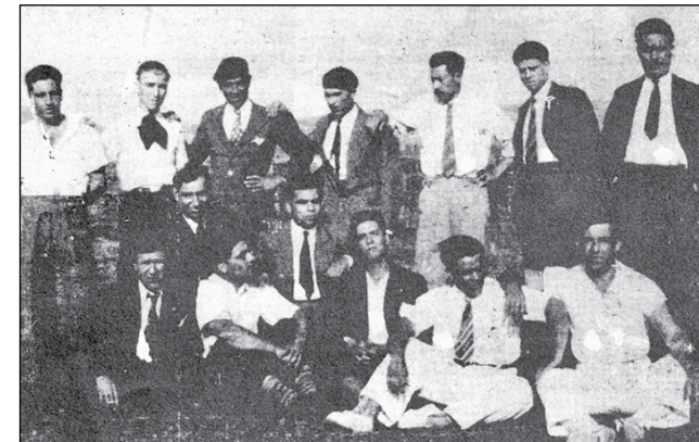
Members of Portuguese anarcho-syndicalist General Confederation of Labour (CGT), jailed by fascist regime, Sao Joao Baptista prison, 1935 [See Chapter 8]