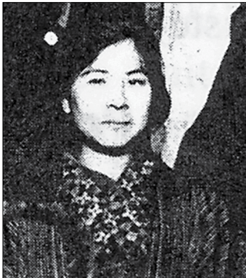
Itô Noe (1895–1923), Japanese anarchist and unionist, murdered by police [See Chapter 6]