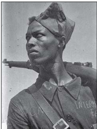
The anarchist revolution in Spain was aided by tens of thousands of international volunteers - anarchist militiaman at Bakunin Barracks, Barcelona, 1936 [See Chapter 9]