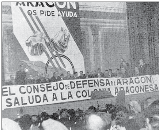
The Committee of Aragon, a bottom-up planning body of delegates, linking collectives and militias in revolutionary Spain [See Chapter 9]