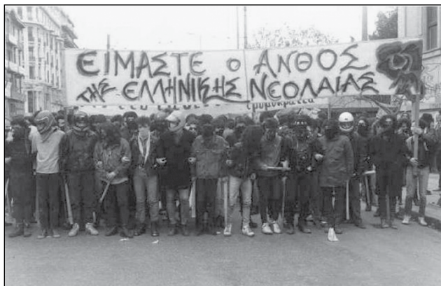
Greek anarchists have played a major role in anti-neoliberal struggle following the global financial crisis of 2007 [See Chapter 10]