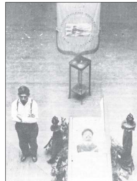
The funeral of Mexican anarchist leader Ricardo Flores Magón (1874-1922), Mexico City [See Chapter 4]