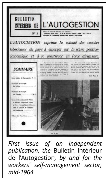
First issue of an independent publication, the Bulletin Intérieur de l'Autogestion, by and for the workers' self-management sector, mid-1964

In the here and now, this demonstrates that we must be organised and openly struggle as anarchists to take advantage of the political moments a revolutionary period offers, and that the political lines we develop early in a struggle can have significant outcomes. One can draw a line between the decision to rely on bombing and military force as the means of revolution in 1954 and the overthrow of Ben Bella and the decay of autogestion in 1965.