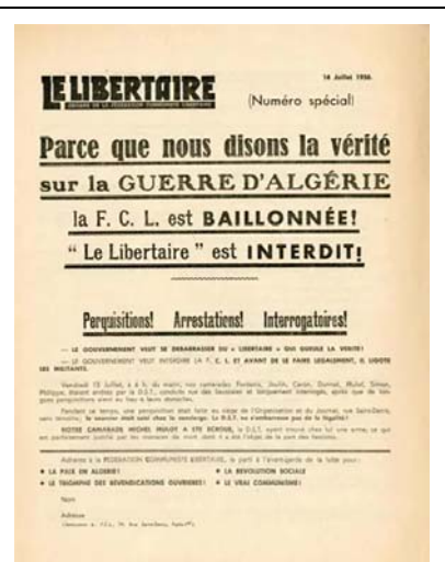
Front cover of the 14th July 1956 edition of the FCL's publication Le Libertaire . Title reads "Because we speak the truth about the Algerian war, the FCL is jailed! Le Libertaire is banned!"