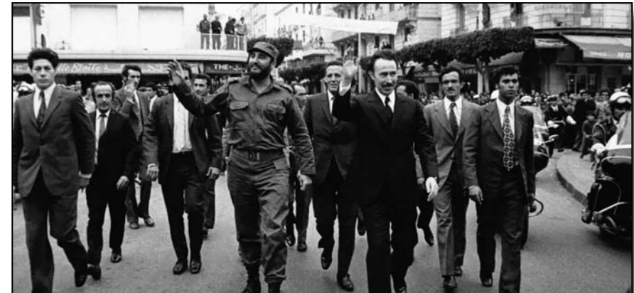
Ben Bella (front and to the right) and his staff walking with Fidel Castro during a state visit to Havana in 1962.