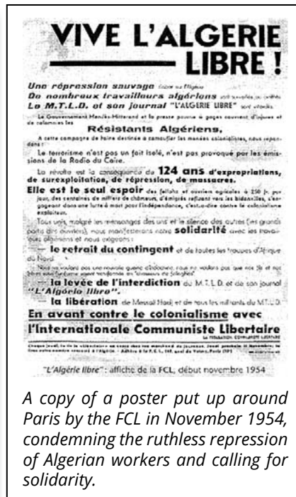
A copy of a poster put up around Paris by the FCL in November 1954, condemning the ruthless repression of Algerian workers and calling for solidarity.